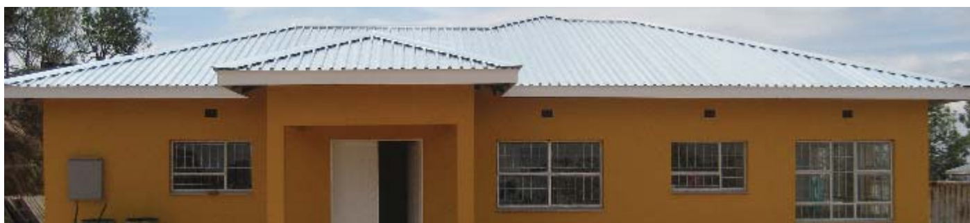
BHF supported HIV/AIDS Clinic on the outskirts of Mbabane

This project is a continuation of BHF work to support the wood processing industry in the country, one of the most promising economic sectors for economic development.