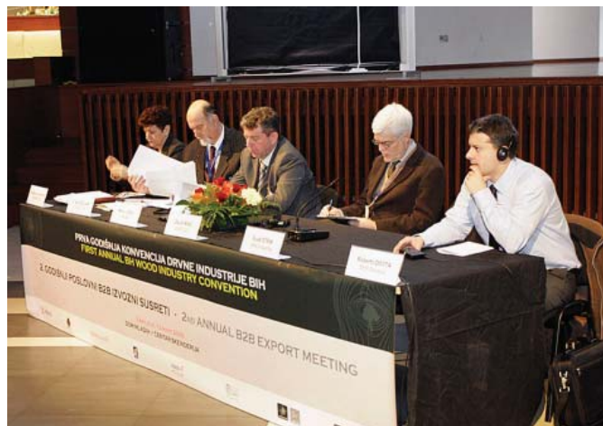
Panel of the B2B Meeting in Sarajevo

companies. In addition, such a center would also become a testing and certification center for wood