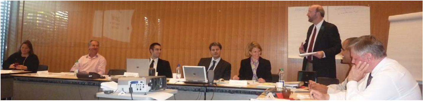
BHF-FESS Workshop Report on Environmental Security and Company Responsibilities