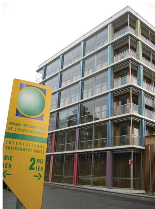
BHF Offices in Geneva