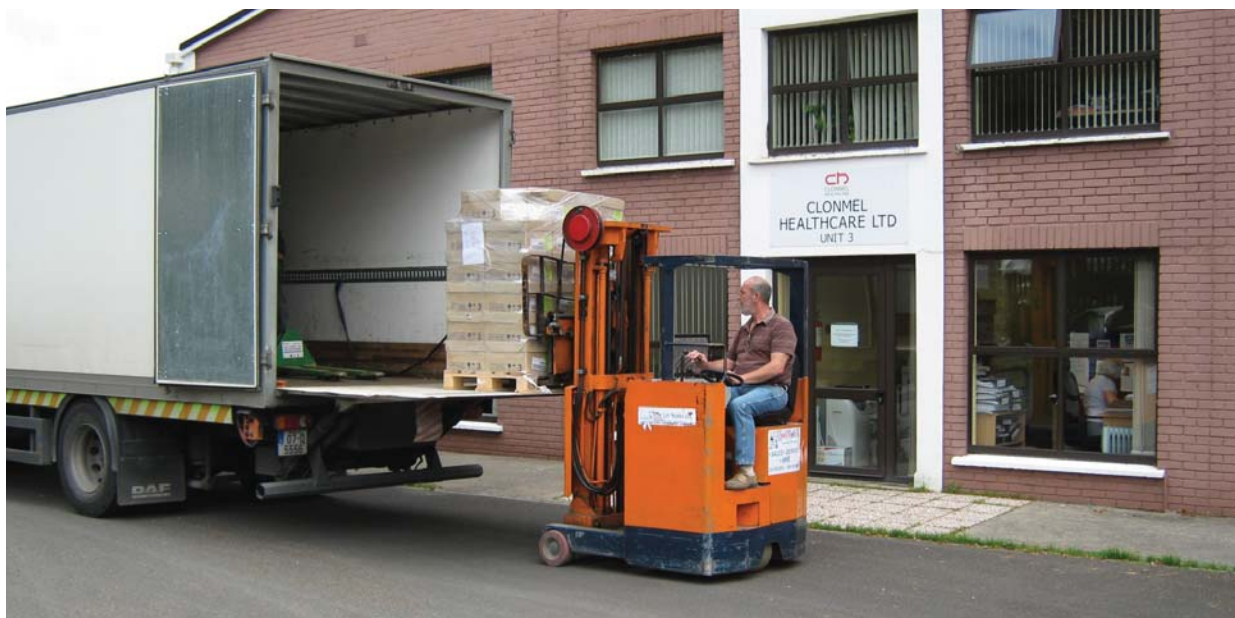
One of the donated medicines pallets being loaded for shipment to Kabul.